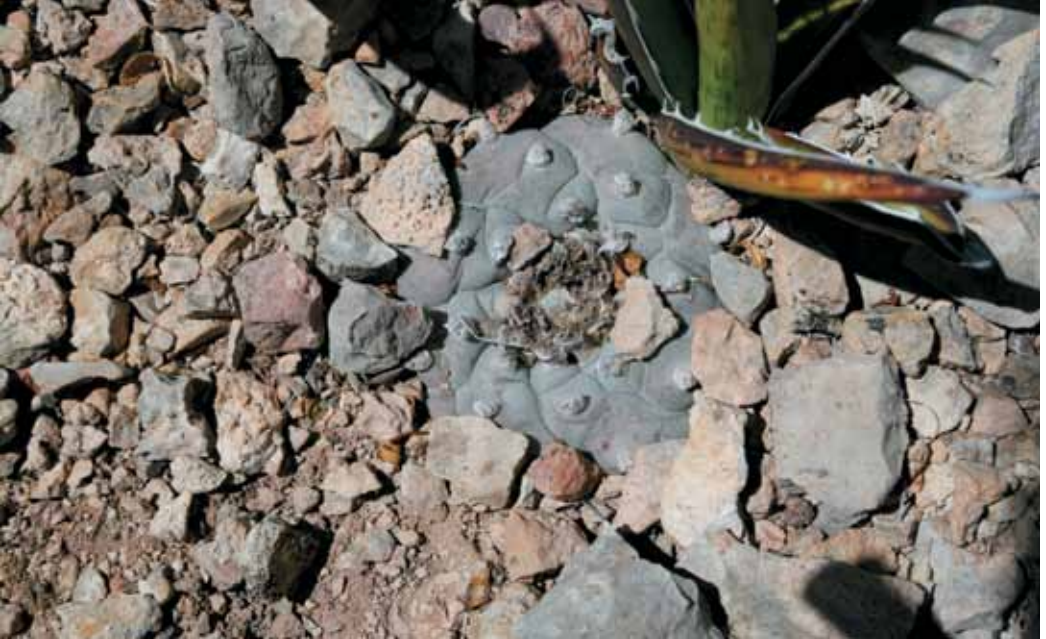
FIG. 1a. An adult peyote cactus (diameter ca. 6 cm) in habitat in Chihuahuan Desert.