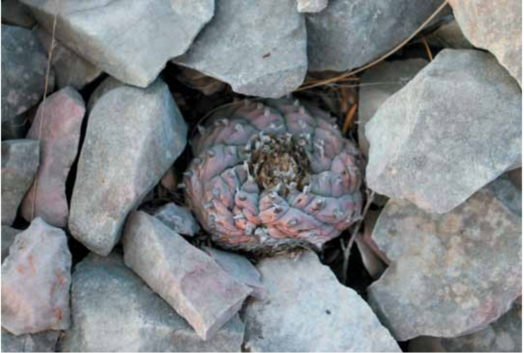
FIG. 2. "Purple peyote" in habitat in Chihuahuan Desert. Plant shows reddish betalain pigment and depleted chlorophyll resulting from the severe drought of 2010–2011.

In order to eliminate the possible confounding factors of drought stress and dehydration from this geographic phytochemical analysis, we collected all the peyote tissue samples during the rainy season in July 2010 and desiccated the tissue samples prior to analysis. There is an untested but prevalent belief among NAC members that older/larger peyote plants constitute "stronger medicine" than younger/smaller plants (Teodoso Herrera, pers. comm. based on his personal experience as spiritual leader of the Native American Church of the Rio Grande, and on the opinions of his numerous NAC colleagues). Accordingly, in order to eliminate the possible confounding factor of different stages of maturity of the plants sampled for this study, we collected tissue samples exclusively from individuals with eight ribs, which are young adult plants that are typically ca. 3–5 cm in diameter (Terry et al., unpublished data).