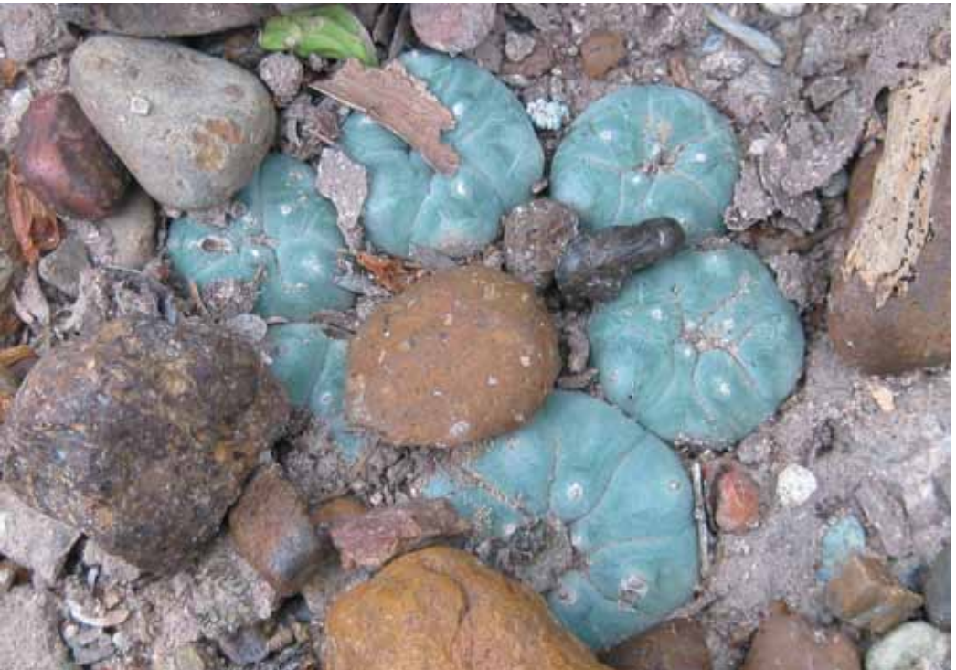
FIG. 1b. Six small peyote cacti (diameter of largest individual is ca. 4 cm) in habitat in Tamaulipan Thornscrub. The circular grouping and small size indicate that these plants are regrowth resulting from the harvesting of the crown of the parent plant (not visible) by peyote cutters in recent years.