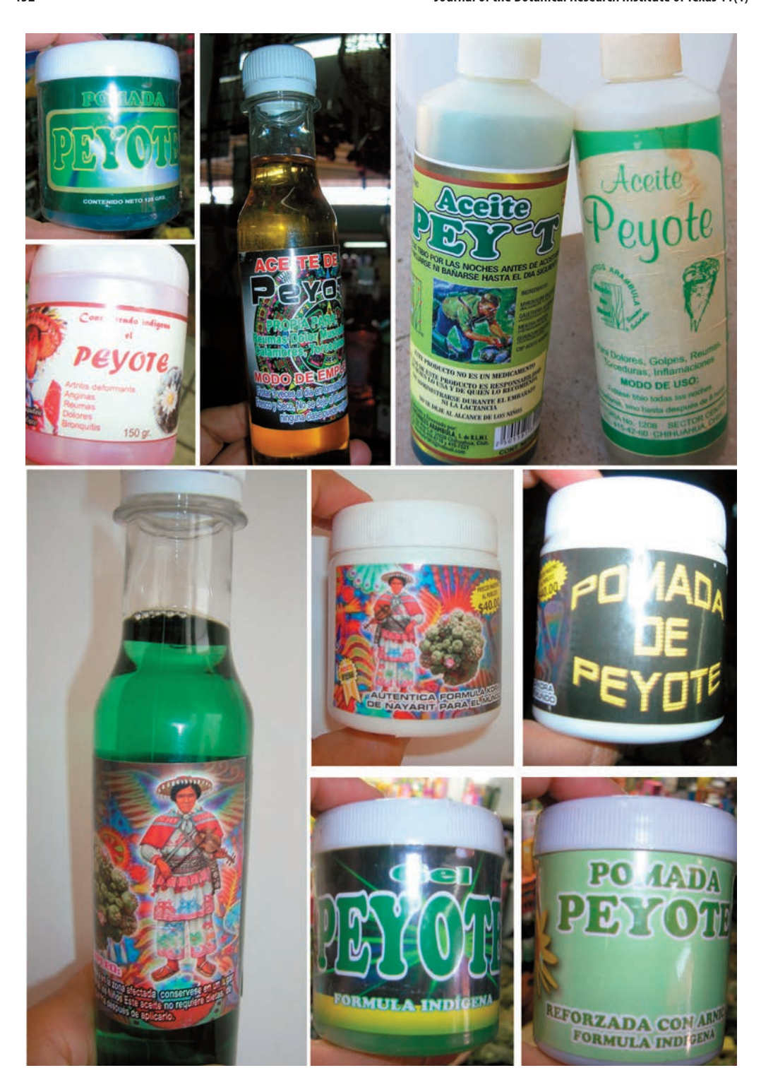
Fig. 2. A selection of topical pomadas (ointments) and aceites (oils) with labeling which suggests that peyote is a major active ingredient for the topical treatment of rheumatic pains.