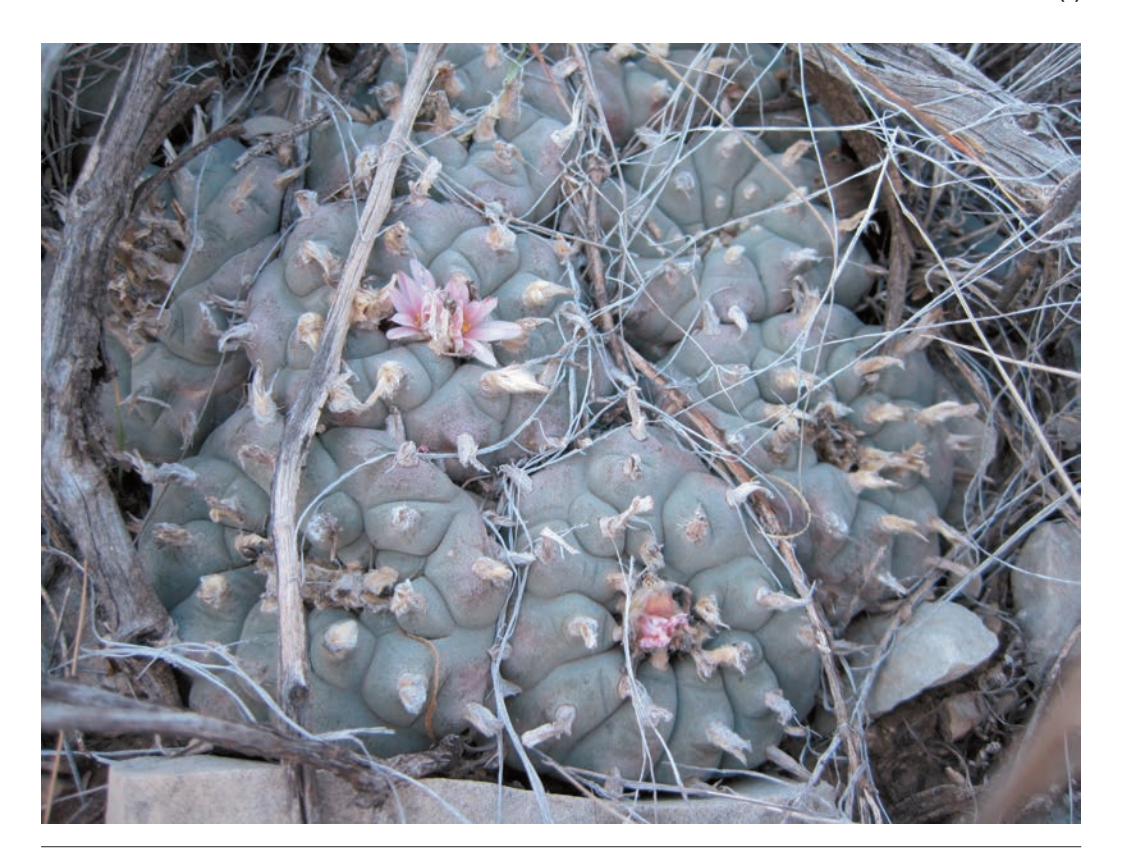
Fig. 1. A large, multi-stemmed peyote plant growing in the understory of the Chihuahuan Desert of West Texas.

tion discovered the psychoactive effects of peyote and its principal alkaloid, mescaline (e.g., Kerouac 1955). As the Beatniks, who were always a small artistic and literary subculture constituting only a tiny fraction of the U.S. population, gradually faded from the scene due to actuarial attrition, they were replaced in the 1960s and 1970s by a new "counterculture" that included the Hippies—essentially a widespread and highly vocal generation of young people who espoused quite different values from those of the dominant culture with which they reluctantly shared the country. Among those values, clearly articulated in the pop music and literature of the time (e.g., Dylan 1966; Robbins 1971), was an often sophisticated taste for a spectrum of psychoactive drugs which the cognoscenti of the counterculture referred to as "psychedelics" (drugs that expand the mind)—which, of course, included peyote.